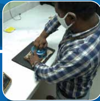
3. Laboratory Test