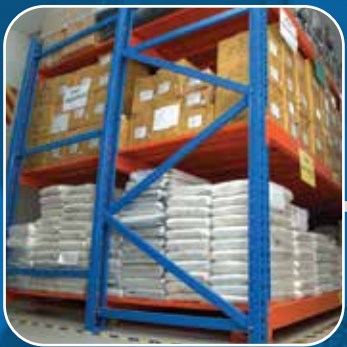
10. Ware House