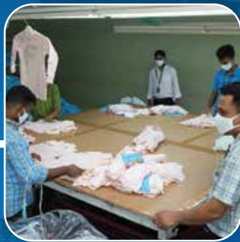
9. Quality Audit