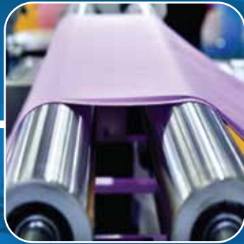
2. Dyeing & Finishing